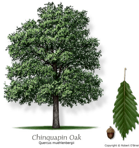
Chinquapin Oak Quercus muehlenbergii