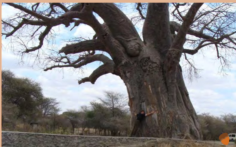
Photo: Tree hugging at Tarangire NP Tanzania

I look forward to years of work and fun, post-COVID, in our unusual profession, and I'm curious to see what the next two decades will bring in our green industry and world.