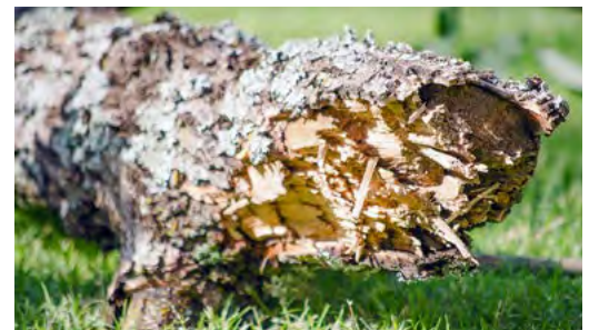
Figure 3. Police photo showing the broken end of the branch. Note the fibrous break on the underside and the brash break on the upper side.