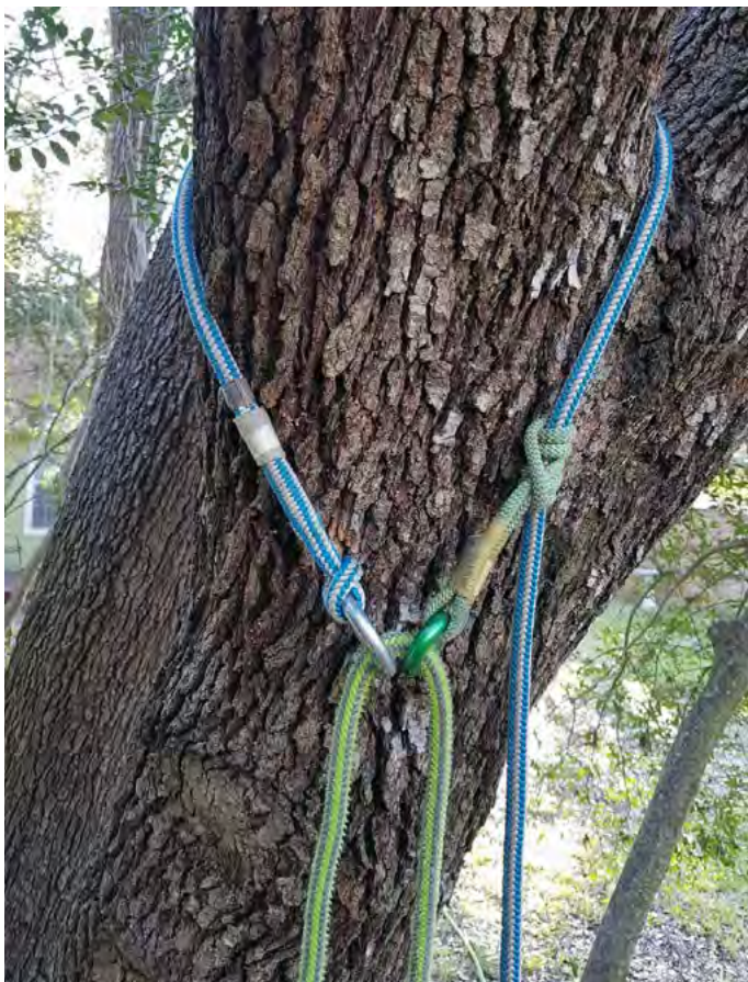
Adjustable friction saver.

One of the big problems with body thrusting is that in most cases it is done entirely with the arms. By not using your legs, you are leaving your biggest muscles out of the equation. Why? You can use your legs when body thrusting by simply ►