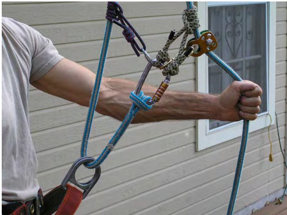
A version of the sliding bridge setup.

SRT: Of course the newest advance in climbing is single rope technique. Although it seems like nationally its popularity is hitting the exponential phase, that does not seem to be happening in Texas. And in my opinion, this is where climbers