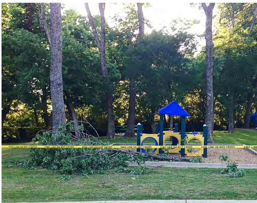
Figure 2. Police photo showing the branch on the ground.

Although the standard of care does not require that we perform formal tree risk assessments on every property we visit, we are expected to know how to identify tree hazards, and, we are expected to keep our eyes open, have a good look around, and report any hazards that we do observe.