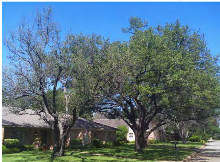
The oak tree on the left is showing oak wilt symptoms, while the oak on the right is healthy.

For many years, the oak wilt fungus has been considered atypical compared to other species in the Ceratocystis genus, but it didn't fit into the other genera in the Ceratocystidaceae family. After DNA testing, taxonomists decided to break it out into its own genus, Bretziella , named after Theodore W. Bretz, who first discovered and described the sexual state of the type species of this genus. The new scientific name for oak wilt is Bretziella fagacearum . You can read more at https://mycokeys.pensoft.net/article/20657/ .