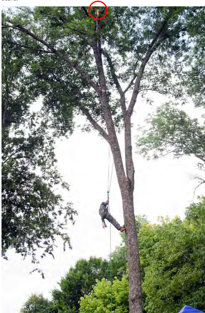
Figure 1. Subject ash showing recently broken stub. Note climber for scale.

HOA for negligence and failure to maintain the park in a safe manner. The main arboricultural components of the case involved determining the cause of the branch failure and researching the standard of care for maintenance of the trees in the park.