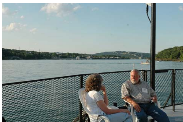
Boat trip social on Town Lake