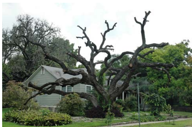
Oak wilt casualty