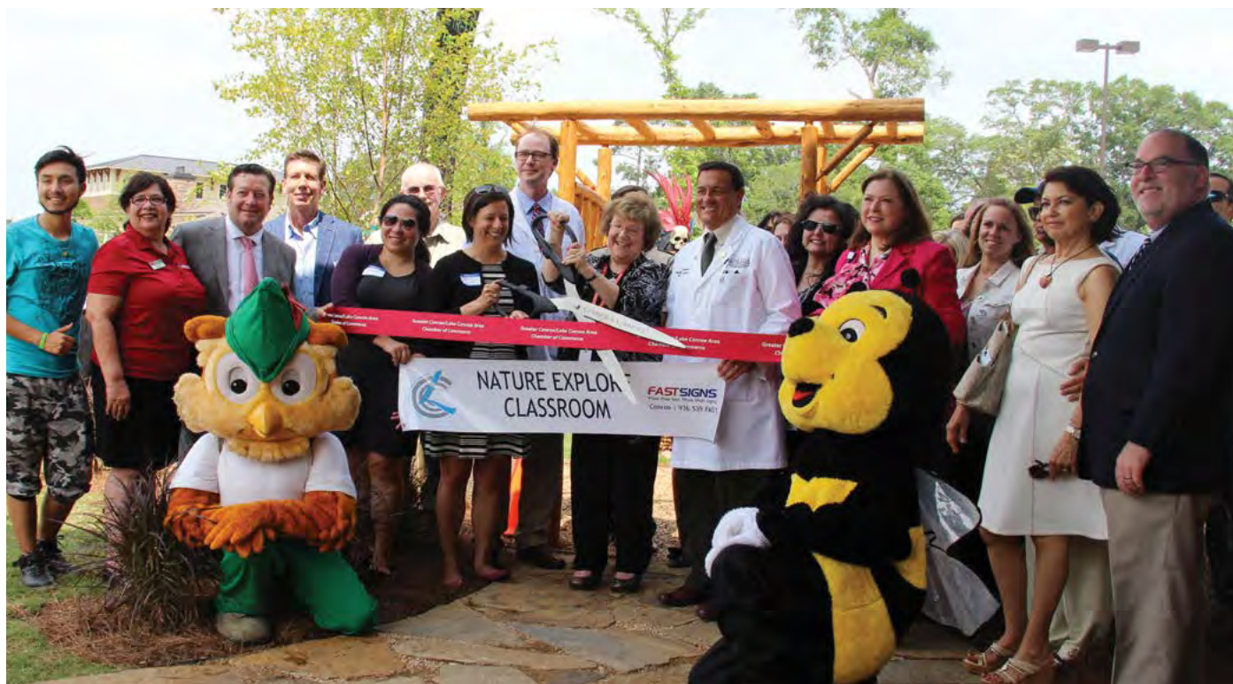
Ribbon cutting, with over 100 people attending the ceremony, recognized this space as the first in the nation to connect doctors and patients to a Nature Explore classroom.