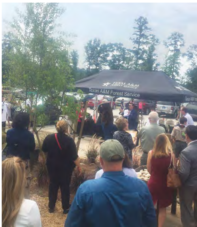
Texas A&M Forest Service handed out containerized southern crabapple trees at the dedication ceremony.

A $500 donation from the B. Koontz Fund, Texas Society of American Foresters, helped provide tree tags for all of the trees planted in the Nature Explore classroom.